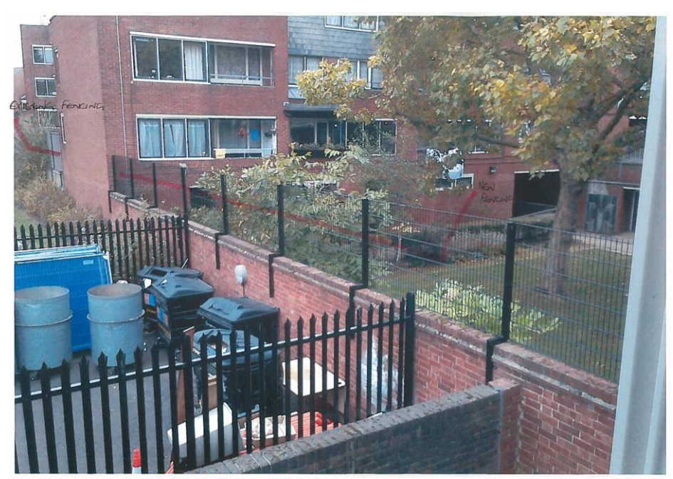
North-eastern boundary wall backing onto gardens to Chalbury Walk showing new fence was installed