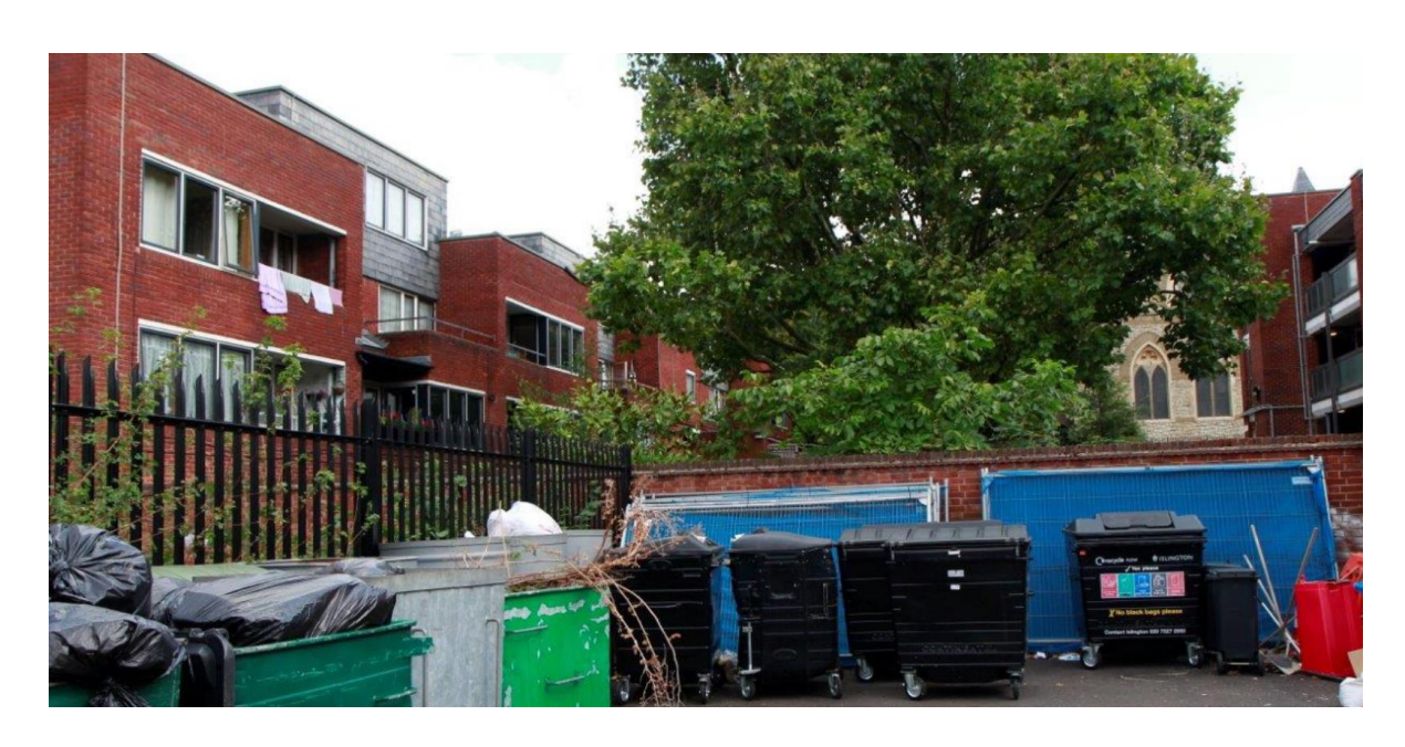
North-eastern boundary backing onto gardens to Chalbury Walk before new fence was installed