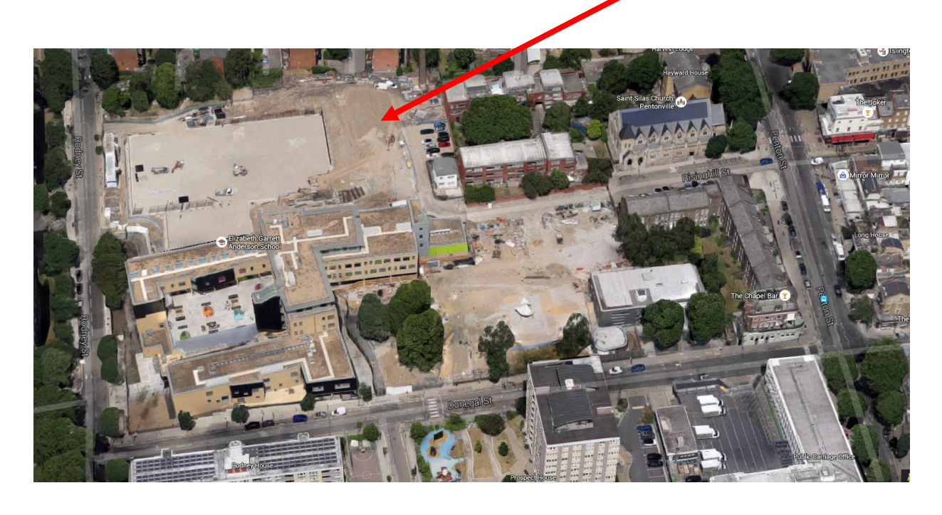
Aerial view of the site arrow pointing at location of new fence